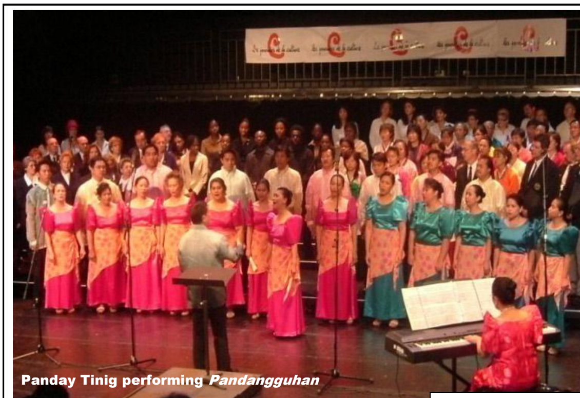
Panday Tinig performing Pandanguhan