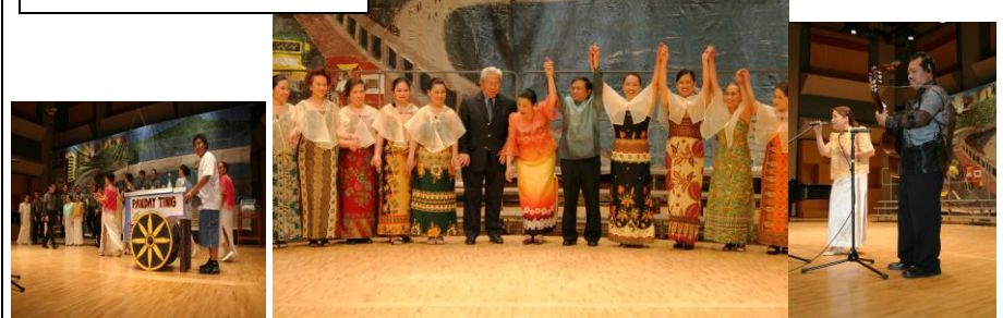
Musical Benefit for Leyte mudslide victims, March 26, Dawson Hall, St. James United Church, Montreal